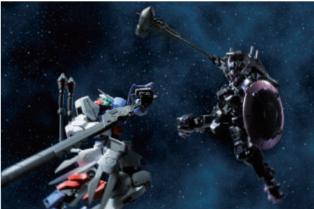
▲ Volume 1, Chapter 6: "Decisive Battle" Rosario's Gundam Vual confronts Liarina, who is in the race to succeed Tantotempo. The exterior of the Vual is that of Astaroth, which Volco is trying to restore. Two mobile suits with the Gundam Frame clash violently for their own ends.