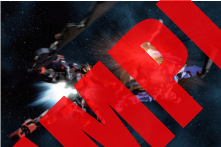
▲ Volume 2, Chapter 6: "Fighting as a Brother." Zaza shows his determination to fight as Zadiel Zalmfort. Argi, too, goes into battle with all his might to fulfill his promise to Mina. But in Zaza's head, there's an ulterior motive that no one else knows.

► The first product in the HG "Gekkou" series. It recreates the distinctive asymmetrical form and comes with a unique set of armaments, such as the foldable Demolition Knife and the left arm Sub-Knuckle with fingers that can move independently.